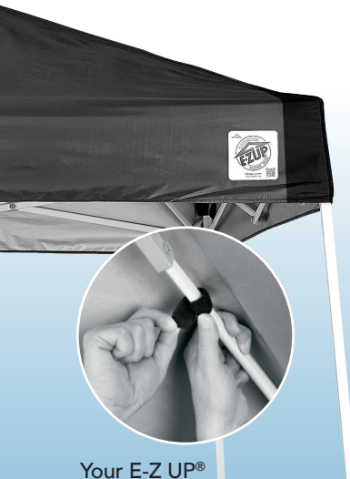
Your E-Z UP® shelter setup is now complete!

Note: It is recommended that you use genuine E-Z UP® Deluxe Weight Bags and/or heavy-duty Stake Kits to secure your Instant Shelter® product.