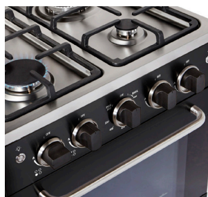
Modern knobs designed for cooktop & oven