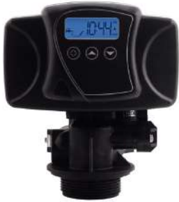
(1) FLECK 5600-SXT Downflow Valve (with ADAPTER INPUT/ OUTPUT 12-VOLTS