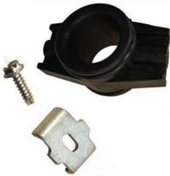
(2) ADAPTER COUPLING ASSEMBLIES with O-RING (PRE-ATTACHED TO THE VALVE)