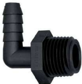
(1) 5/8" DRAIN BARB FITTING