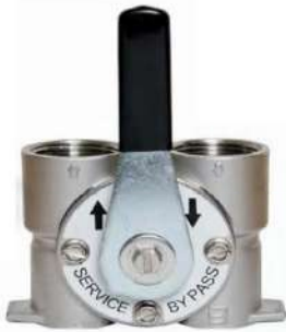
(1) 1" STAINLESS-STEEL BYPASS VALVE