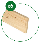
4ft. x 5.5 in. Boards