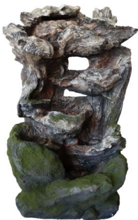
Fountain (4 LED lights pre-installed) 1x