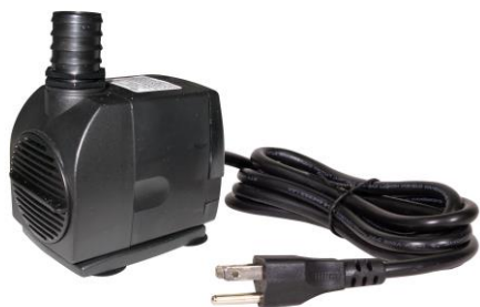
Fountain Pump 1x