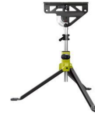
Mul-Function Jaw Stand 1108