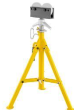
Pipe Jack Stand With Roller-Head 1109