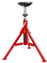
V-Head Pipe Jack Stand With 4-Ball 1107B4-BALL