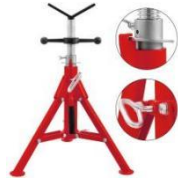
Pipe Jack Stand With V-Head 1107C