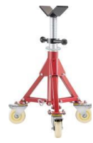
V-Head Pipe Jack Stand with Casters 1107CV