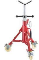
V-Head Pipe Jack Stand with Casters 1107BV