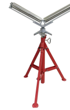
V-Roller Head Pipe Stand 1106