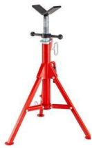
Pipe Jack Stand With V-Head 1107