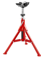
V-Head Pipe Jack Stand With 2-Ball 1107A2-BALL