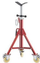
V-Head Pipe Jack Stand with Casters 1107AV