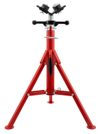
V-Head Pipe Jack Stand With 4-Ball 1107S4-BALL