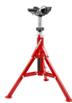
V-Head Pipe Jack Stand With 2-Ball 1107C2-BALL