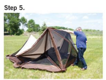
Continue around shelter repeating the previous step until all panels are erect.

Step 1. Remove the loose fabric wrapped around each of the hubs.