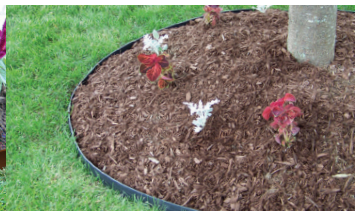
Use Around Trees