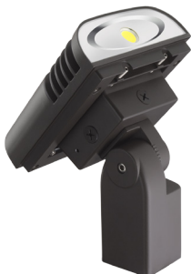
OLWX1TS Slipfitter – size 1