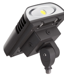
OLWX1THK Knuckle – size 1