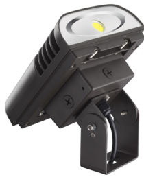
OLWX1YK Yoke – size 1