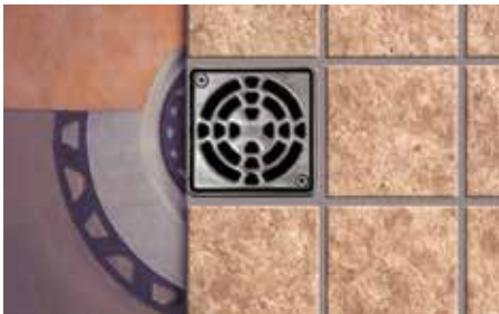
Schluter®-KERDI-DRAIN assembly with Schluter®-KERDI waterproofing membrane.

and features additives to produce a water vapor permeance of 0.18 perms.