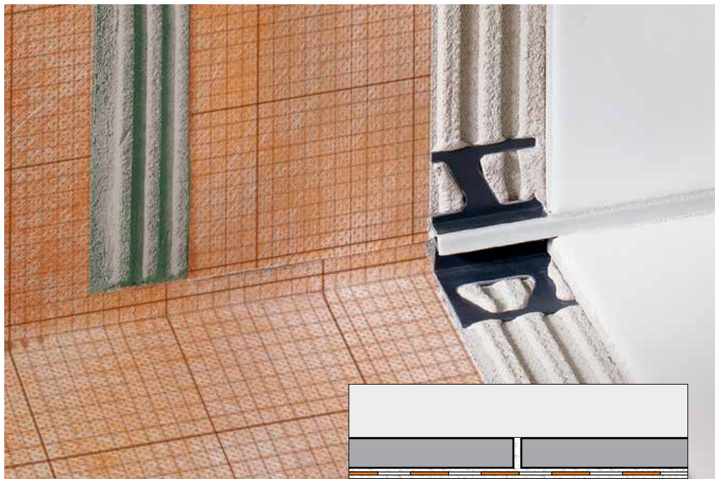
8.1 Schluter®-KERDI 8.1 Schluter®-KERDI-DS

Preformed, seamless corners include the following. KERDI-KERECK-F are used to seal 90° inside and outside corners. KERDI-