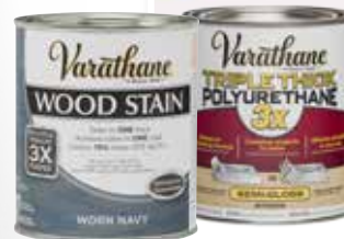
As shown Varathane 3X Wood Stain in Worn Navy, and Varathane Triple Thick Semi-Gloss Polyurethane