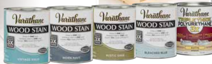
As shown Varathane 3X Wood Stain in Vintage Aqua, Worn Navy, Rustic Sage, Bleached Blue and Varathane Triple Thick Satin Polyurethane