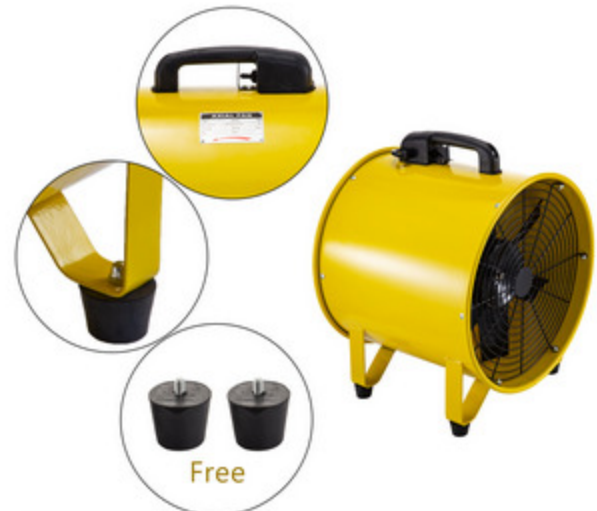
COMPACT & PORTABLE