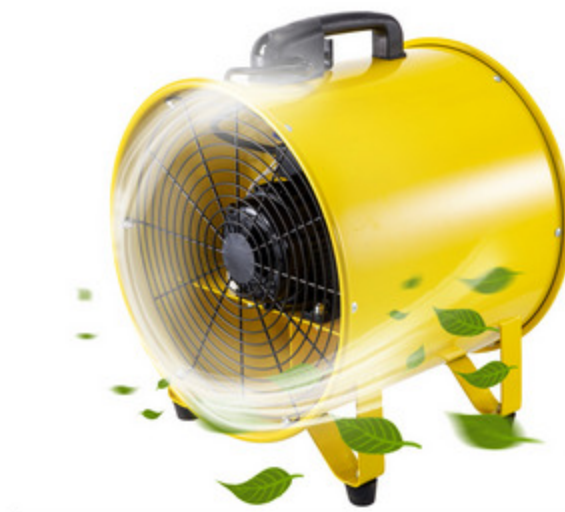
HIGH VELOCITY & POWERFUL