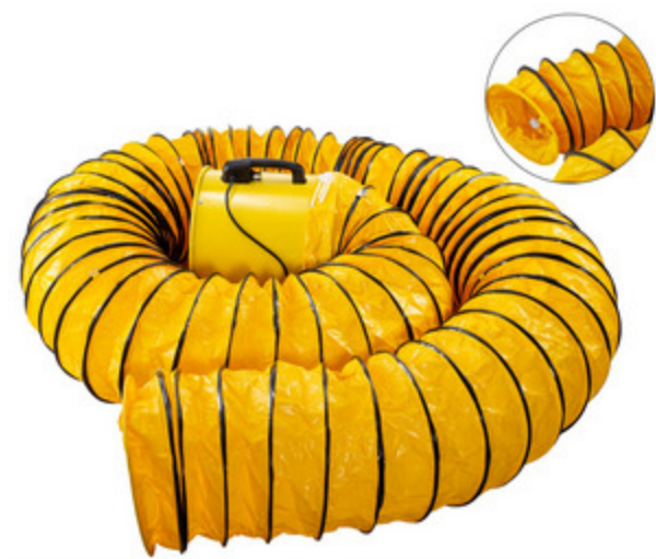
FREE 10-METER HOSE

This portable exhaust fan is designed with a high-quality steel shell, which can resist rust, compression, vibration, and deformation. As a result, a slight drop or impact will not affect the internal parts. In addition, two high-density covers prevent small animals from flying into the machine.