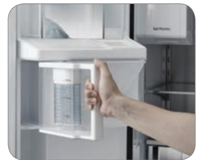
Auto Fill Water Pitcher