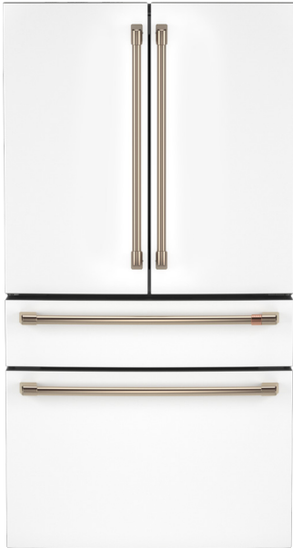
GE29DP4TW2 Matte White with Brushed Bronze handles