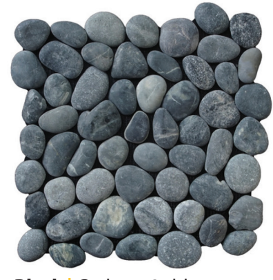
Black | Code: xp3pbk