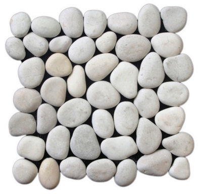
White | Code: xp3pwh