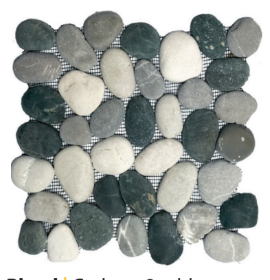
Blend Code: xp3pabk