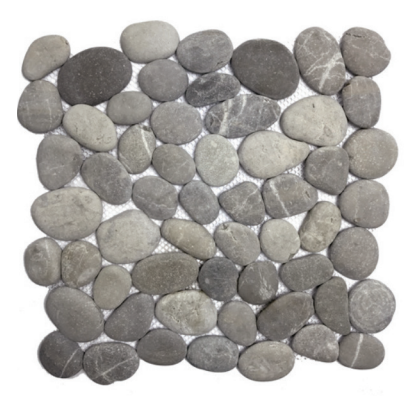
Grey | Code: xp3pgr