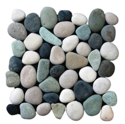
Blend Code: xp3pbgt