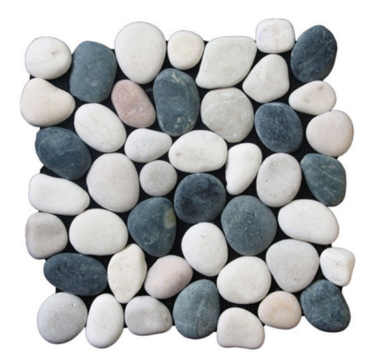
Blend | Code: xp3pbwt