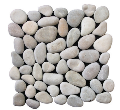
Tan | Code: xp3ptn