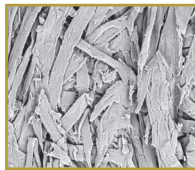
Paper Tape 250x magnification