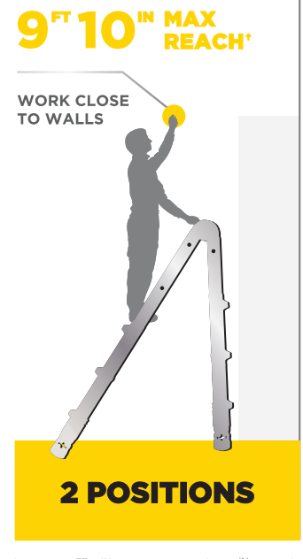
^{\dagger} Based on a 5^{\text{\tiny FT}}6^{\text{\tiny IN}} person with 12^{\text{\tiny IN}} reach