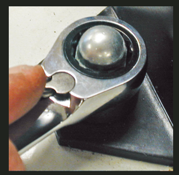
Reversing lever allows you to switch motion from left to right without removing the wrench.