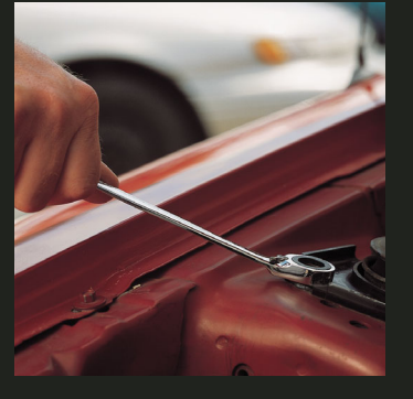
15° offset allows for safe operation above the work surface, providing additional knuckle clearance.