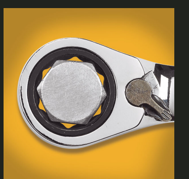
Surface Drive <sup>®</sup> provides a stronger grip on fasteners.