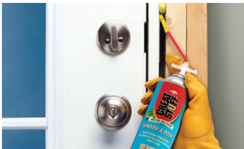
Doors and their rough openings

Use GREAT STUFF™ Window & Door Insulating Foam Sealant to seal around windows and doors and their rough openings.