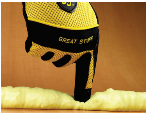
When cured, remains soft and flexible. Cured foam can be stuffed back into the gap without trimming.