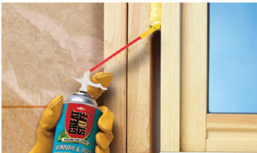
Windows and their rough openings