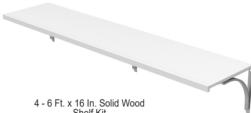
4 - 6 Ft. x 16 In. Solid Wood Shelf Kit