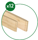
Side Walls (6) long (6) short