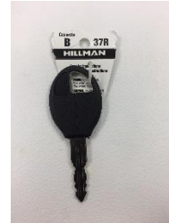
(37R Key Blank)