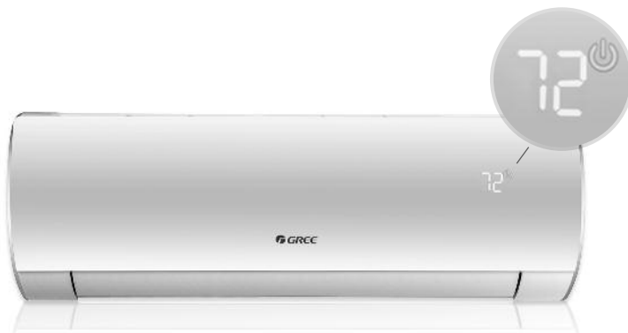
INDOOR UNIT FRONT PANEL DISPLAY: Look here for LED display of system status, setpoint and indoor temperatures and malfunction codes.