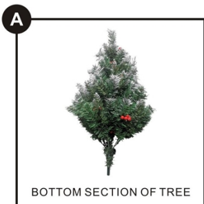
BOTTOM SECTION OF TREE