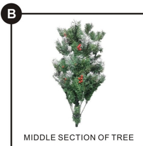
MIDDLE SECTION OF TREE