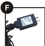
Plug Belt 8 Functional Controller

NOTE: Christmas tree lights: LED lights with 8 function controller.