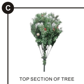
TOP SECTION OF TREE