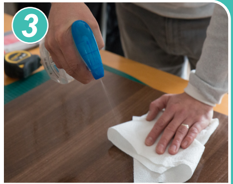
Clean thoroughly to remove any grease and dust