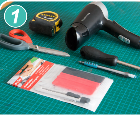
Tools for the job