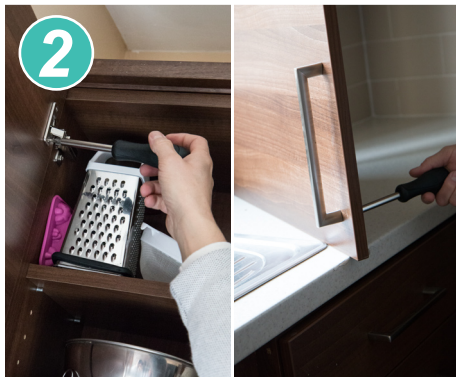
Remove doors and handles