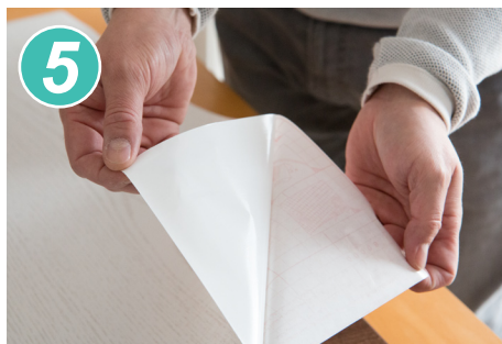
Peel away a small section of backing paper and stick the film into place. Gradually peel away the rest of the backing paper little by little, smoothing out to the sides as you go. If you make a mistake simply peel back and start again