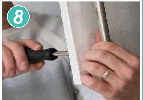
Hang doors back into place, re-attach the handles, stand back and admire your handy work!