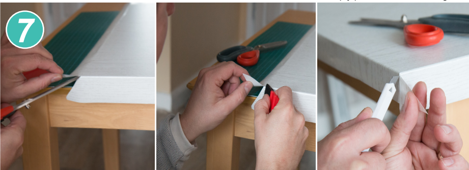
For neat corners, cut diagonally into the corner with scissors. Fold one flap around the corner, then the other. You will be left with a small triangular excess which can be trimmed away with your scalpel, then wrap the rest of the excess film over the edge to the inside of the door, this can be trimmed later if you prefer. Repeat for all 4 corners & sides