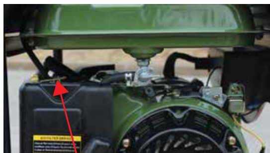
Choke (Figure B)