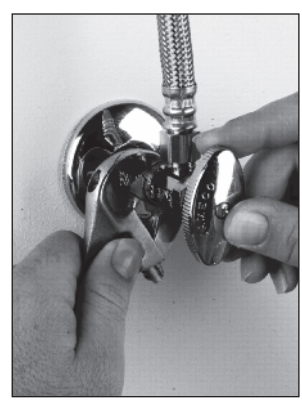
1. Turn off water supply and remove angle stops.

For ease of installation, leave the existing compression ring and nut from the angle stops on the hot and cold water lines.