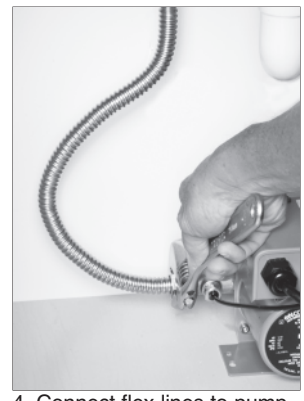
4. Connect flex lines to pump.