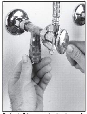
2. Install tees and attach angle stops.