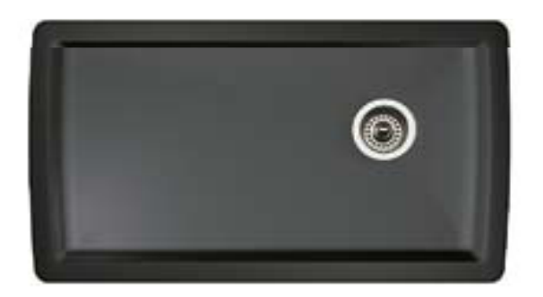
Model 441768 shown