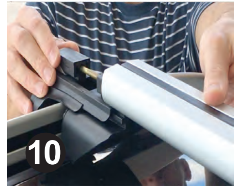
10 Slide rack into the support brace on the opposite side. (Trim Channel Strip again if rack doesn't fit completely )