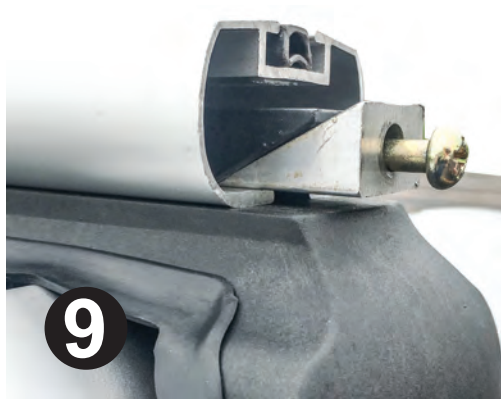
9 Loosen screw and slide rack, short Channel Strip Insert at bottom, into support brace