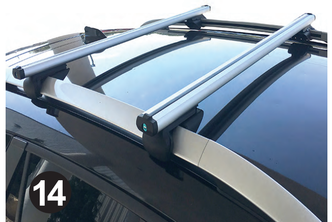
14 Repeat the process on back of vehicle

DO NOT EXCEED 165 LB MAX LOAD (INCLUDES ALL ACCESSORIES)