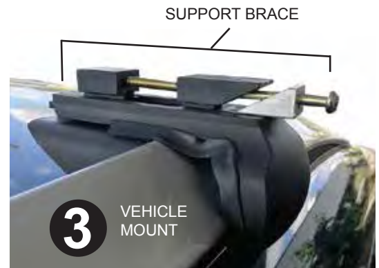
3 Attach the support brace to the existing mount at front of vehicle