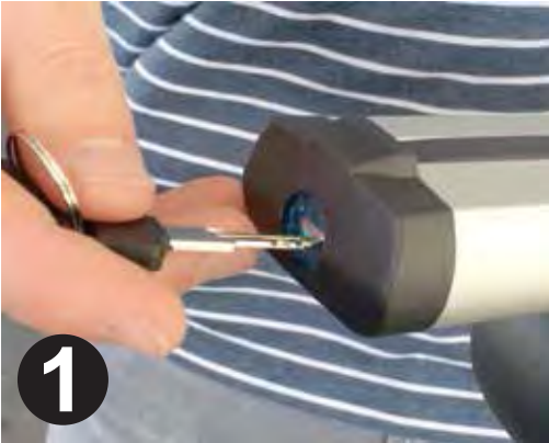
1 Insert key to unlock and remove End Cap

READ AND UNDERSTAND ALL WARNINGS BEFORE ASSEMBLY