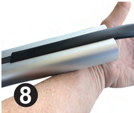
8 Slide Channel Strip Insert into the bottom of rack

READ AND UNDERSTAND ALL WARNINGS BEFORE ASSEMBLY