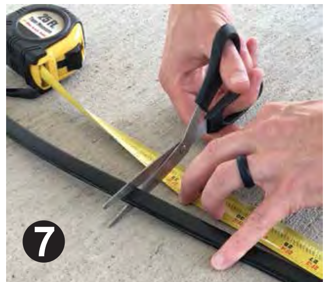
7 Cut Channel Strip Insert to that length. (Channel Strip helps reduce wind noise)

DO NOT EXCEED 165 LB MAX LOAD (INCLUDES ALL ACCESSORIES)