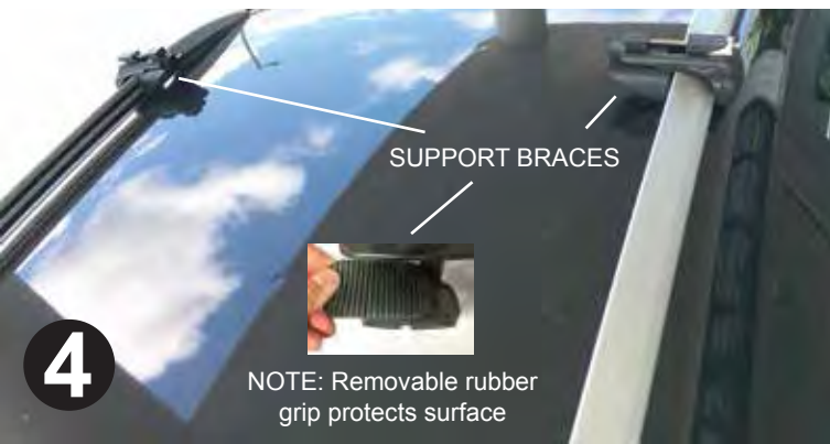
4 Attach the support brace on the opposite mount