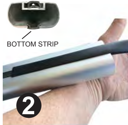
2 Remove Channel Strip Insert from bottom of rack