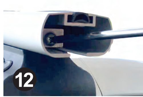
12 Use phillips screwdriver and tighten screw on both sides