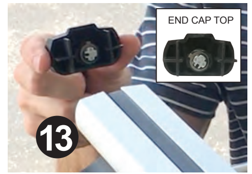
13 Insert key, unlock end cap, then insert. Once in place, lock end cap. Repeat on opposite side