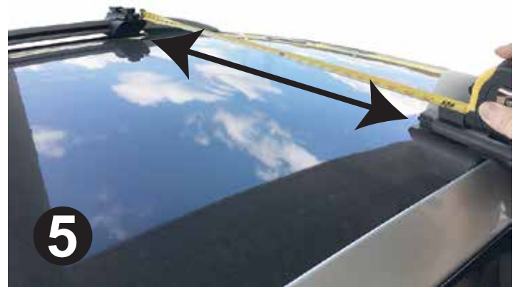
5 Measure distance between support braces