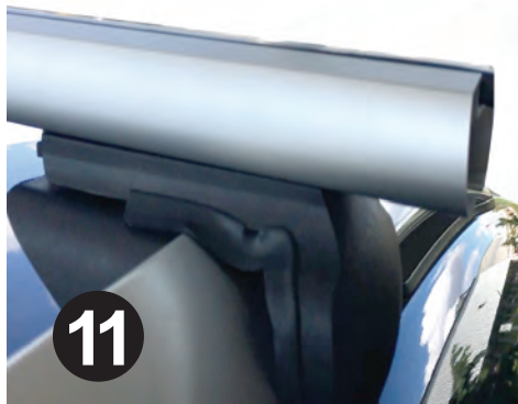
11 Center the rack, so it is evenly spaced between the two support braces