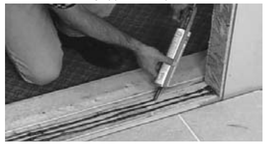
STEP 3: REMOVE PACKAGING MATERIALS

Apply three <sup>1</sup>/<sub>4</sub>" lines of caulk (acrylic caulk is recommended) along the length of the sub-sill, the first line starting approximately 1" from the inside edge. The lines should be about 1" apart.