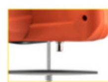
Limit switch The machine automatically cut off when the stopper is triggered.