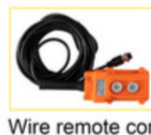
Wire remote control