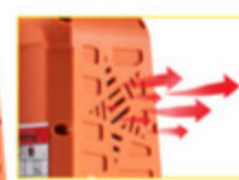
Gear box High working efficiency & heat dissipation for ventilation.