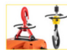
High-strength hook It can rotate 360 degrees with safety latch.