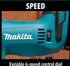
Variable 6-speed control dial (800-3,500 SPM) enables user to match the speed to the application