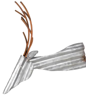
Deer Head 1x