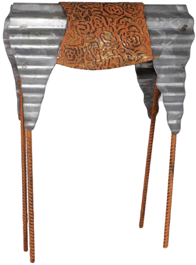
Deer Body 1x