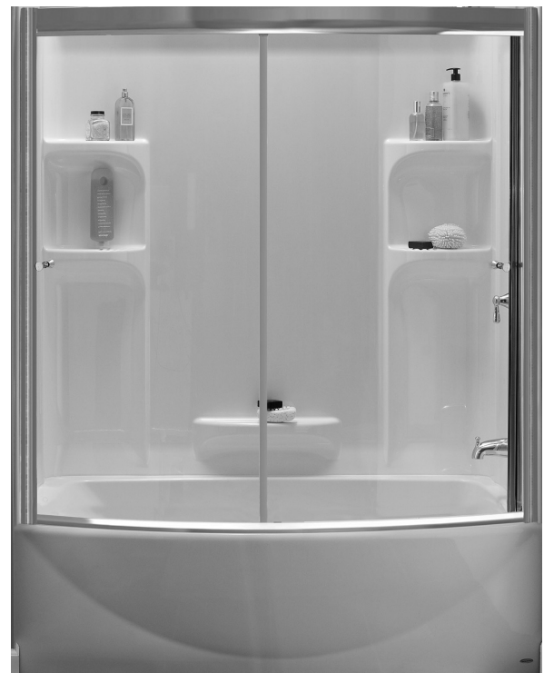
Ovation tub with Ovation wall set and Ovation curved bath door shown.

For color/finish availability and other faucet choices, please see the Product Selector and Pricing Guide.