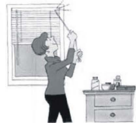
Lock cords into position whenever horizontal blinds or shades are lowered, including when they come to rest on a windowsill.