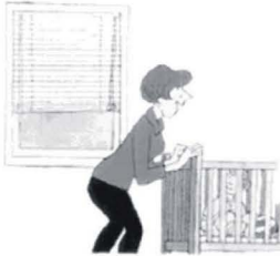
Move all cribs, beds, furniture and toys away from windows and window cords, preferably to another wall.

Keep cords out of children's reach. You can use one of these devices available at your local hardware stores: Cleat, Clamp or Clothes Pin, Tie downs