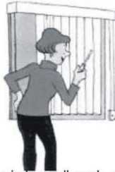
Keep all window pull cords and inner lift cords out of the reach of children. Make sure that tasseled pull cords are short and continuous-loop cords are permanently anchored to the floor or wall. Make sure cord stops are properly installed and adjusted to limit movement of inner lift cords.