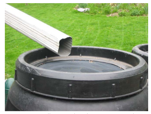
Downspout elbow used to direct water into the barrel. Can also use optional "Flex elbow" to direct the water from the downspout.

Note: If you have gutters that go directly into the ground use the UpCycle Products Rain Water Diverter to hook up your barrel. See "Rain Water Diverter." You can link 2 or more barrels together using a Linking Hose. See "Linking Hose."