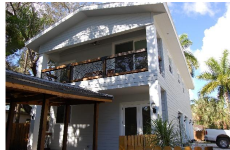
Completed Project: Fort Lauderdale, Florida