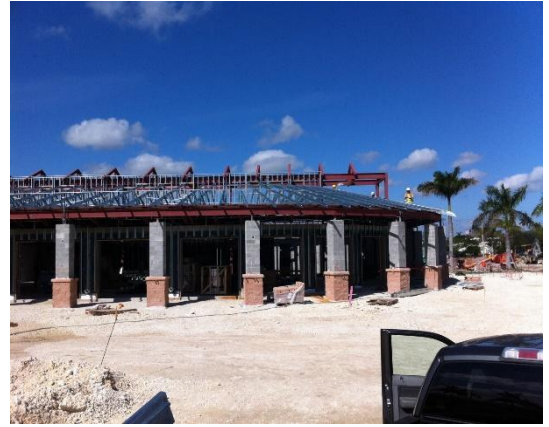
Homestead Airforce Base