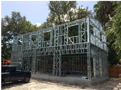
Steel Frame Assembly: Fort Lauderdale, Florida