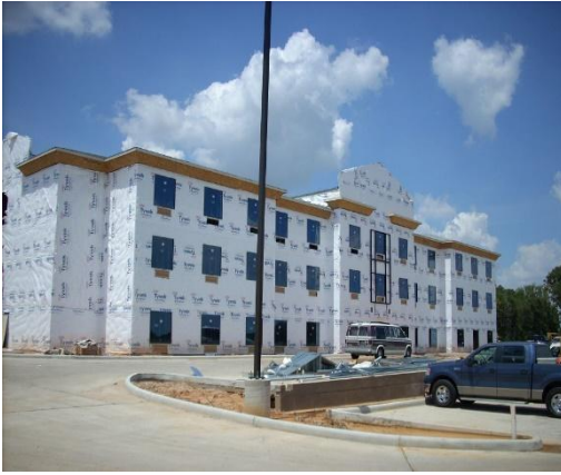
Holiday Inn Express & Suites Hearne, Texas