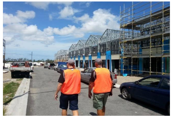
Strip Shopping Mall

Let our Plus 1 Team help you achieve the home of your dreams this year!