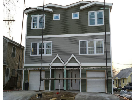
Completed Project: Duplex New Jersey