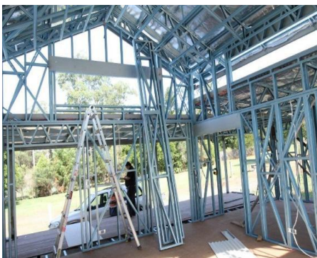
Bungalow with flooring system & deck