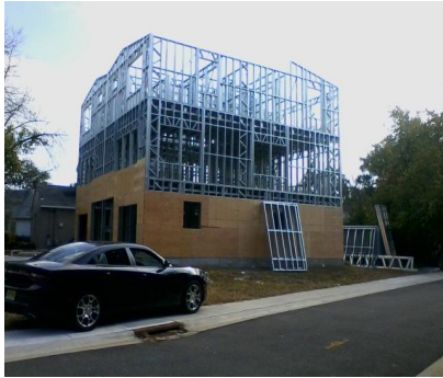
Steel Frame Assembly: Duplex New Jersey