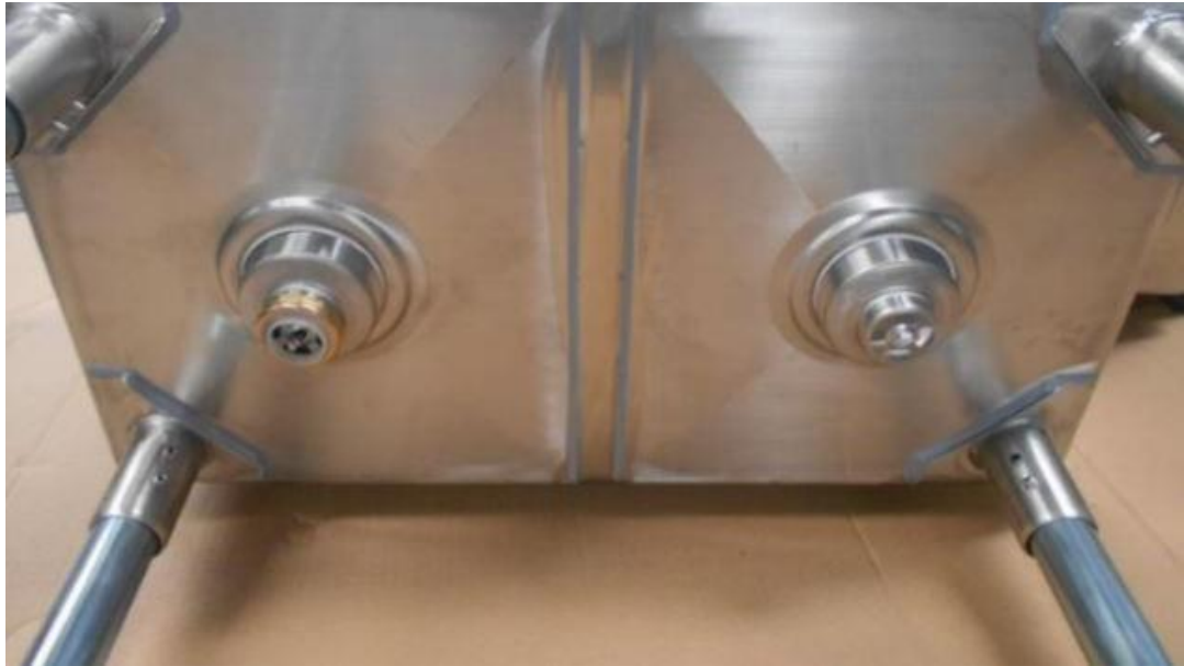
Figure 3 - Inserting the Legs

Step 3: Insert the four legs into the corresponding gussets on the underside of the sink. Then insert the set screws into the set screw holes on the legs. There are two set screws per leg.