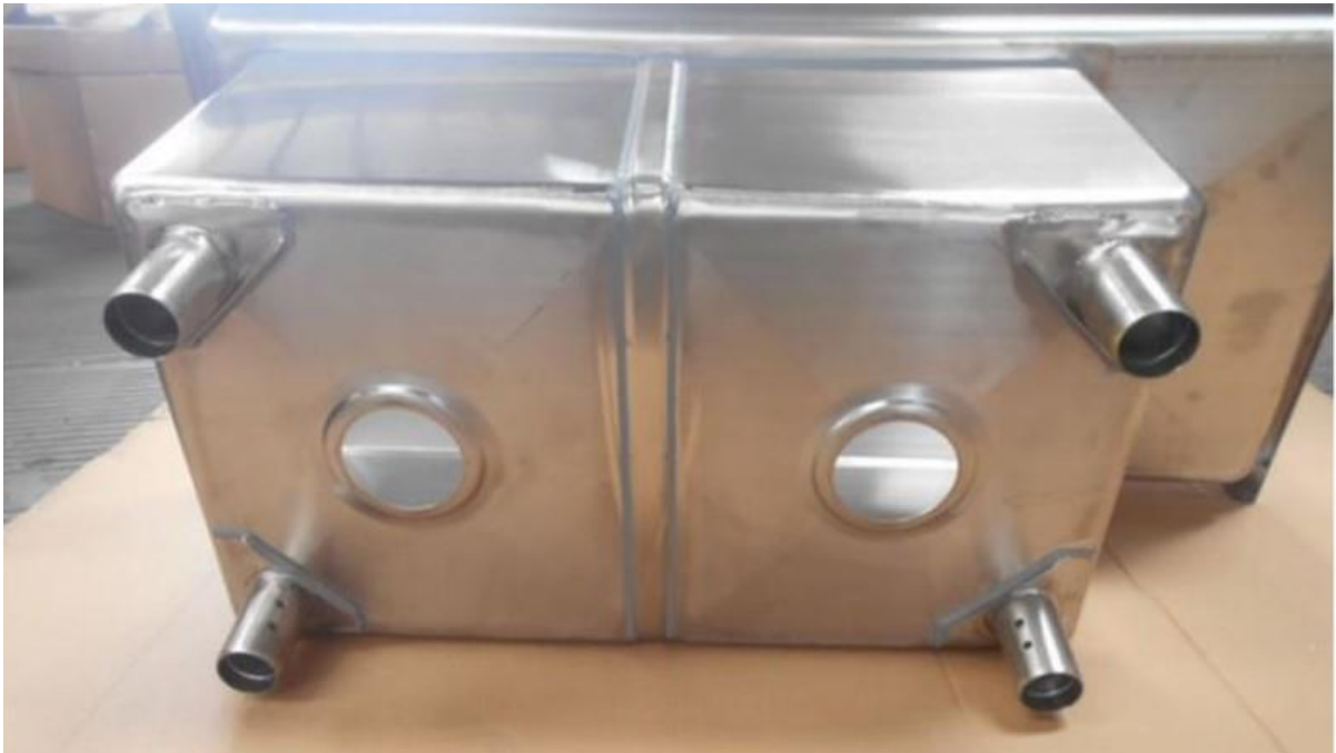
Figure 2 - Underside of Sink Unit

WARNING: THE SINK UNIT MAY BE HEAVY, TAKE PRECAUTIONS TO AVOID INJURY WHEN MOVING AND LIFTING THE SINK ASSEMBLY.