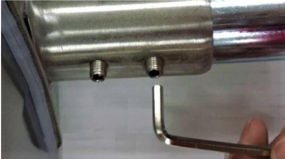
Figure 4 - Tightening the Set Screws

Step 5: Carefully turn the sink over onto its legs, placing it down on all four legs simultaneously to avoid stress on any individual leg.