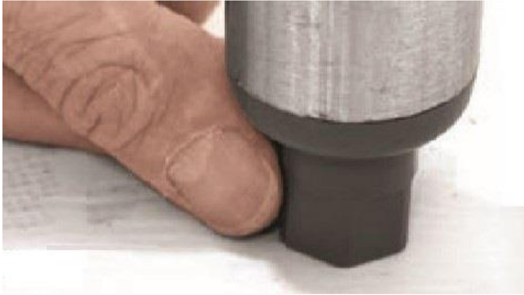
Figure 5 - Adjusting the Bullet Feet

Step 7: The sink strainer consists of six parts, as shown in Figure 6, on the next page. These are: