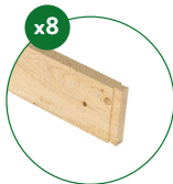
x8 4ft. x 3.5in. Boards