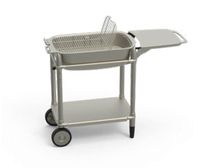
STEP 6. Place REMOVABLE COOKING SURFACE DOOR on right side. Note that the REMOVABLE COOKING SURFACE DOOR is designed to easily hinge upon and closed or to be completely removed for easy access to coals in indirect cooking scenarios.