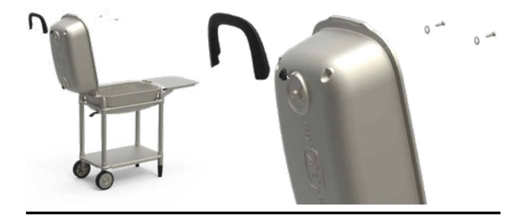
STEP 2. Open the UPPER CAPSULE into the open position and affix the handle using a no. 3 Phillips head screwdriver and supplied screws and lock washers as shown. Securely tighten screws.