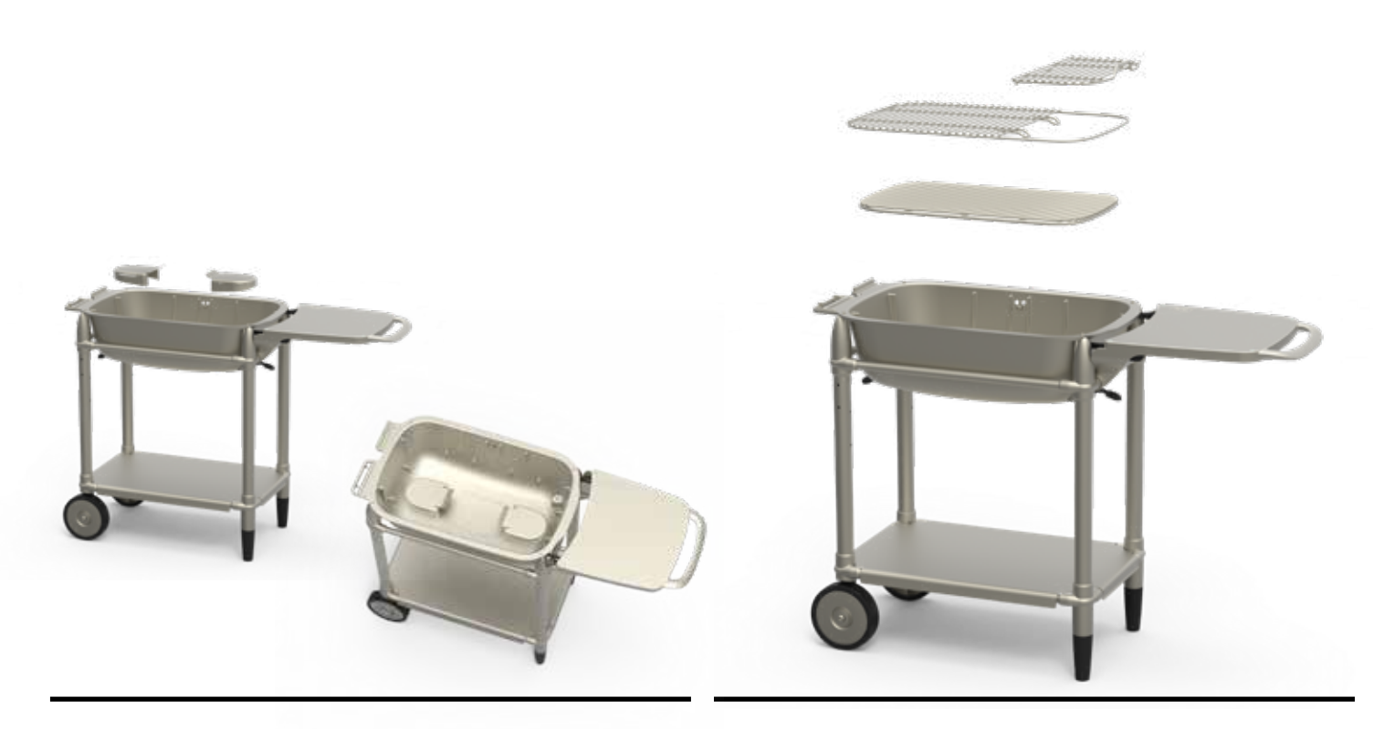
STEP 4. Put the two VENT COVERS in place inside the LOWER CAPSULE as shown.