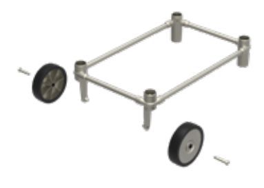
STEP 1. Affix wheels to LOWER CART TUBE ASSEMBLY using two axle screws and 5mm hex wrench. Ensure axle screws are tight.