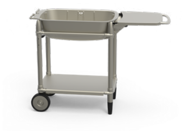
STEP 2. With the UPPER SHELF in the down position, place the LOWER CAPSULE on the cart with the hinge positioned over the wheels as shown. Note the four holes in the lip of the capsule. These holes align with the four top lugs on the UPPER CART ASSEMBLY to ensure proper orientation of the capsule.