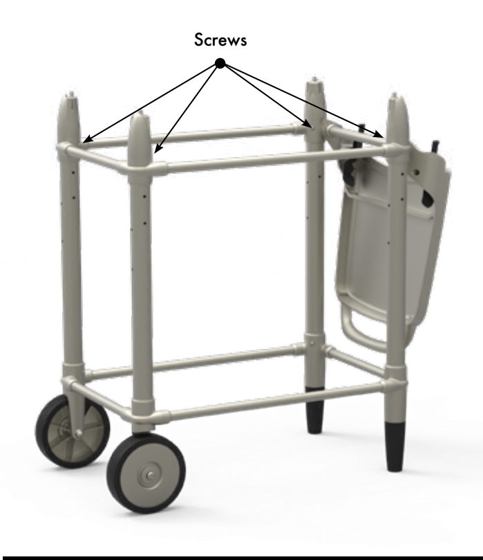
STEP 5. Place UPPER CART TUBE ASSEMBLY on top of the four VERTICAL TUBES as shown. The SHELF should be oriented on the side opposite the wheels.

Ensure the VERTICAL TUBES insert fully into the lugs of the UPPER CART TUBE ASSEMBLY carefully aligning the screw holes in the lugs with the holes in the tubes.