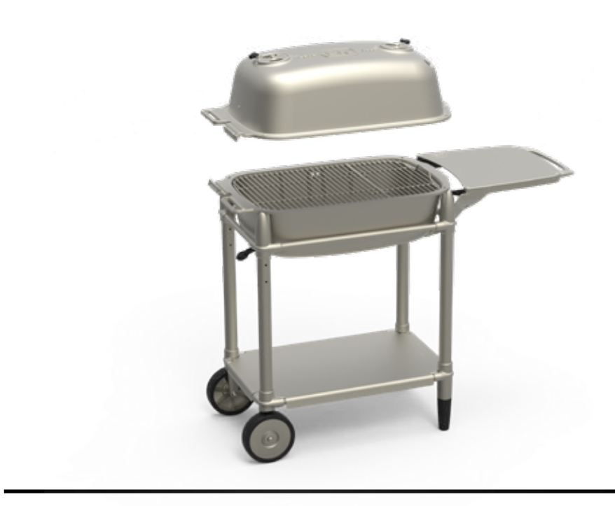
STEP 1. Place the UPPER CAPSULE on the LOWER CAPSULE with hinge oriented as shown.