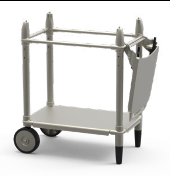
STEP 7. Put LOWER SHELF in place.

Pro Tip: It may be necessary to wiggle the entire assembly slightly to ensure all the tubes are fully seated.