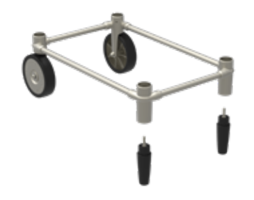
STEP 2. Screw two adjustable rubber feet into LOWER CART TUBE ASSEMBLY by rotating clockwise.