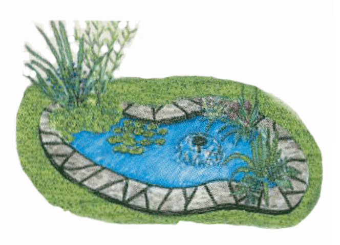
4. Landscape & enjoy!