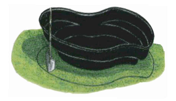
1. Dig hole for pond.