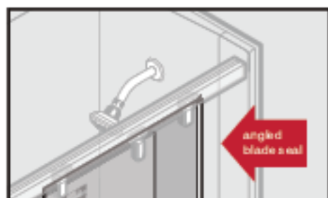
Angled blade seal attached to door

Most Delta Shower Doors are designed to accommodate out-of-plumb conditions up to 3/8". If your shower environment is out-of-plumb, the flexible side angle blade seals compress and relax to fill this gap.