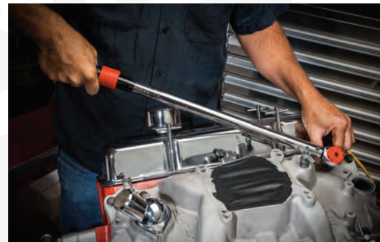
Meets ASME specs with torque accuracy of \pm 4\%

You can depend on the superior performance of Crescent ® Micrometer Torque Wrenches. New Crescent Micrometer Torque Wrenches offer a dependable, fast, and accurate way to tighten fasteners in automotive, agricultural, and commercial/industrial applications. Reversible ratcheting heads make work easier in tight spaces and an audible signal lets you know your target torque has been reached. A slide-back adjustment collar design and large laser-etched markings make setting target torque simple and quick.