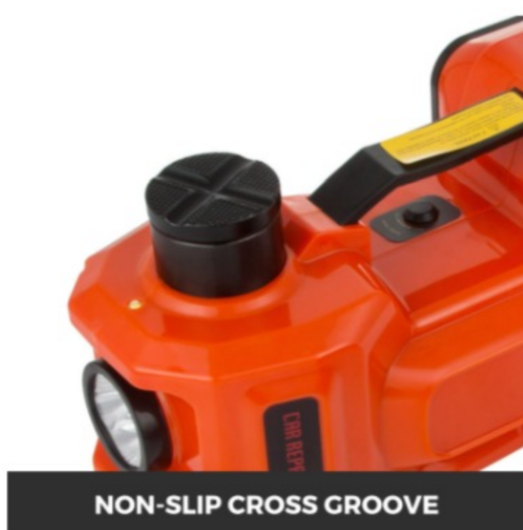
NON-SLIP CROSS GROOVE

Working capacity: 3.0T/6600 lbs. A 12V vehicle power outlet and a low-pressure pull rod are set for sports cars. A dual-motor drive, which can work independently.