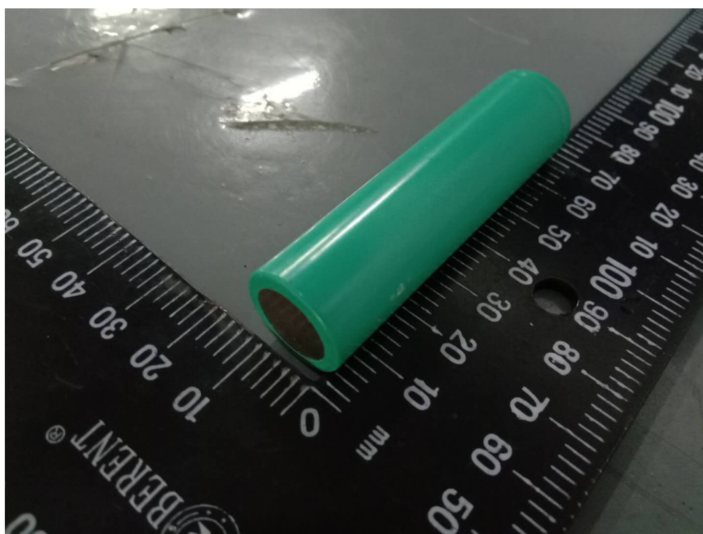
Figure 2 Overall view II of battery