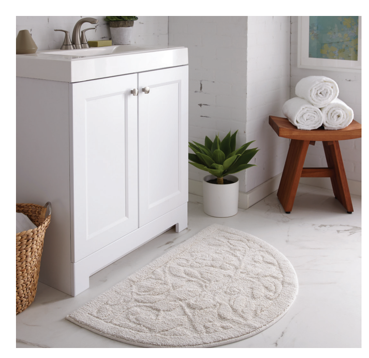
Product # 078325