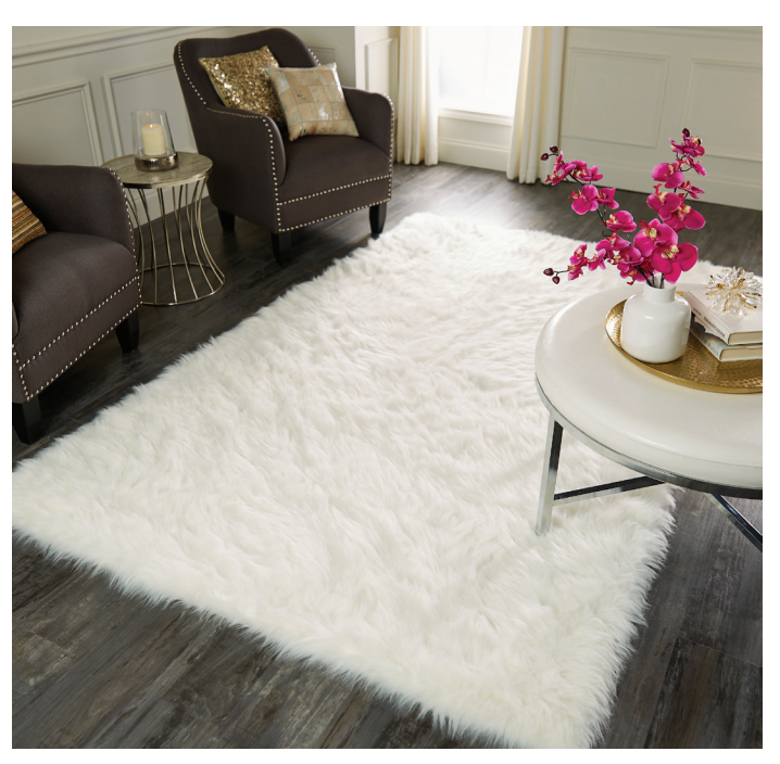
Product # 625948