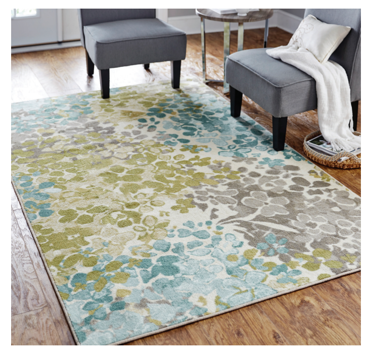
Product # 491321