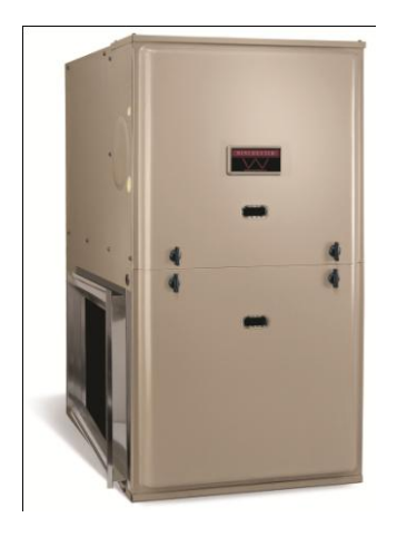
Upflow with side return