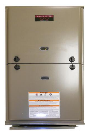
Upflow with bottom return