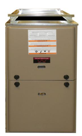
Downflow with top return