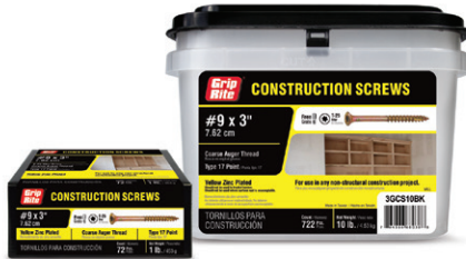
Gold Construction Screw Available in sizes 1-1/4" - 3-1/2" in 1lb. & 5lb. boxes & 10lb. buckets