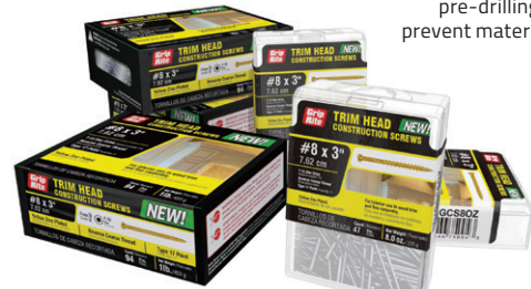
NEW — Trim Head Screws Available in sizes 1-5/8", 2-1/4" & 3" in 8 oz clamshells & 1lb. boxes