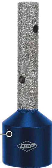
10052 3/4" Diamond Milling Bit