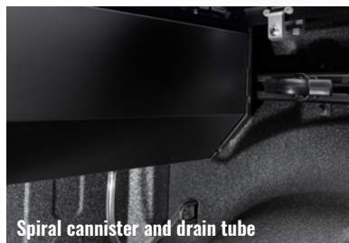
Spiral cannister and drain tube