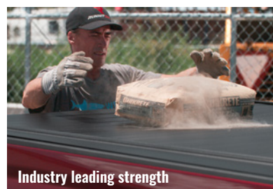
Industry leading strength